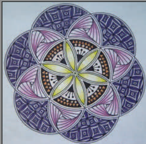
"AWARDS OF EXCELLENCE" MOEKO CHINA