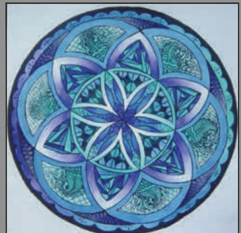
"AWARDS OF EXCELLENCE" FAITH RICO