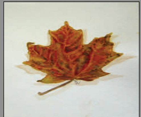
"AWARDS OF EXCELLENCE" RACHEL NITCHMAN