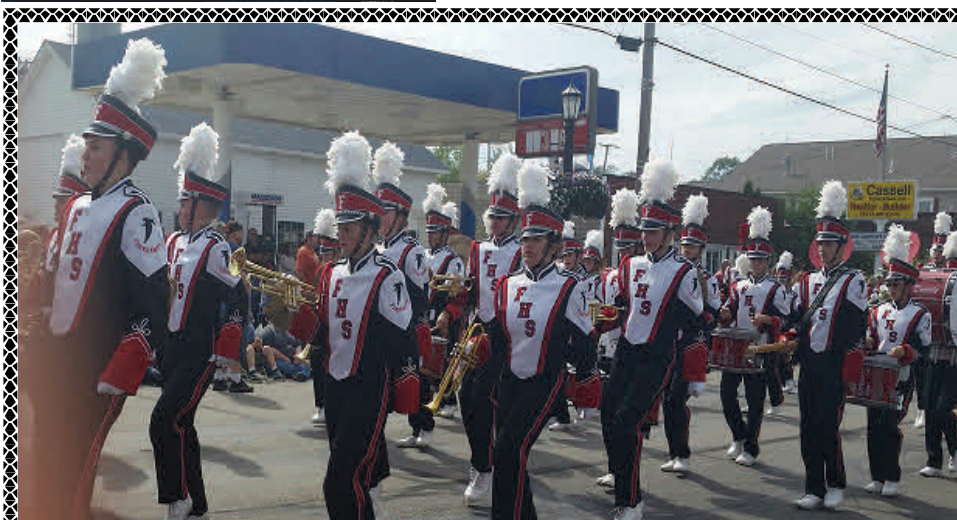
The Firelands Mighty Falcon Marching band at the Woolley Bear Festival